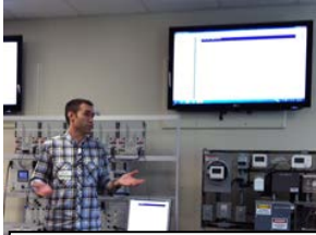
Power Analytics Lab