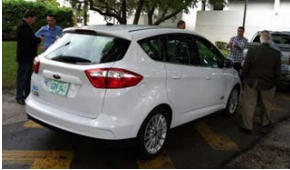
Attendees examine Electric Vehicles

FLATE coordinated a third highly successful energy workshop/forum (the previous workshops were held in Gainesville and Cocoa), for high school and college educators, as well as industry partners, hosted by the Institute for Energy and Environmental Sustainability at Palm Beach State College on January 31, 2014. Forty attendees attended a wide variety of presentations, were treated and participated in a Power Analytics Development activity.