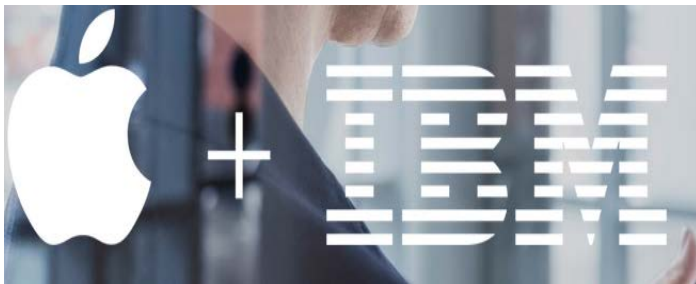
Apple and IBM Forge Global Partnership to Transform Enterprise Mobility