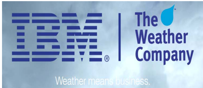
IBM and The Weather Company Partner to Bring Advanced Weather Insights to Business