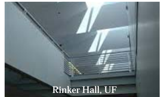
Rinker Hall, UF