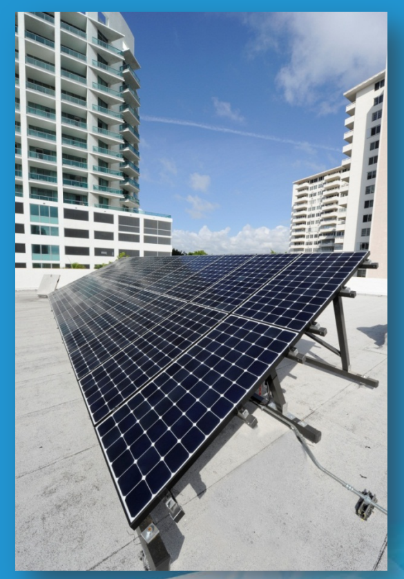
Solar panels on roof of Ft. Lauderdale Community Center