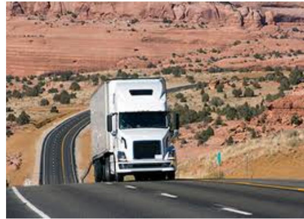
Long Haul & Delivery Trucks