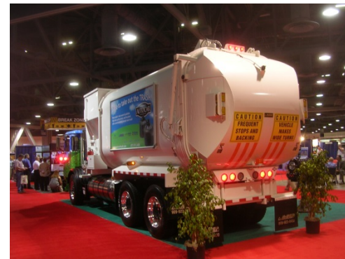
Off Road & Specialty Trucks