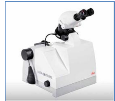
Fig 1. Leica Trimmer

An example of the images obtained after sample preparation using the new instruments can be seen in Figure 3.