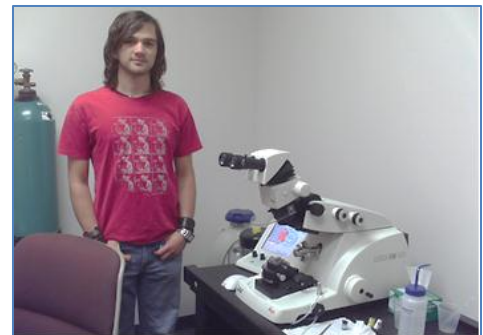
Fig 2. Leica EM UC7 installed at MCF