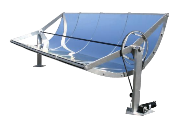
Fig. 2 Solar Collector

The remaining thermal energy will be provided by a natural gas boiler, which will work in series with the solar field and supply thermal energy to the power block when the solar energy is not available.