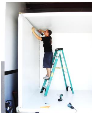
Fig. 1: module construction

To test the effectiveness of different building envelope alternatives, we built 3- 8'x8'x8' structural insulated panel modules, each with a different envelope system. Module 1, the control case, had no additional treatment of the envelope. Module 2 had a 3/4" ventilated airspace on the exterior skin of the roof and walls. Module 3 had a shading device covering the roof and east and west walls.