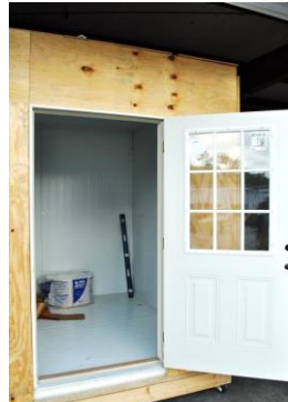
Fig. 2: module 2 complete