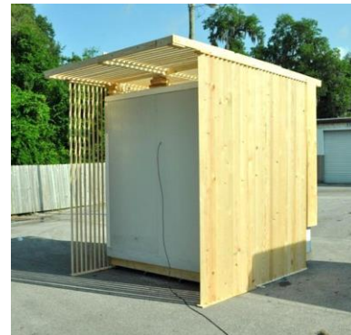
Fig. 3: testing module 3

The 3 modules were monitored under identical conditions simultaneously over an 8 hour period with a Campbell Scientific PS100 Data logger and 3 temperature and relative humidity sensors attached to determine the most efficient and economical configuration of the building envelope. The results confirmed that the module with the shading device had the lowest interior temperature at the end of the 10 hour period. The temperature difference within the modules continued to grow as the hours passed and the insolation continued to raise the temperature disproportionately in the unprotected module 1.