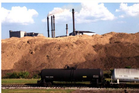
Bagasse – Biomass Residues ("Brown Gold" of the future) South of Lake Okeechobee, Florida

promise a direct route to fuel. UF faculty has been involved in growing, harvesting, and processing algae for over 30 years. The algae research encompasses every aspect of technical development of freshwater and marine algae. The research includes identifying and optimizing algal species, strain development, to maximize fuel quality and production, genetic engineering to maximize lipid, hydrocarbon and carbohydrate content and yield. A systems approach is being pursued to optimize water and land use, biomass harvesting and transport, and refining processes. UF faculty has established centers and laboratories to strengthen the research. These include: