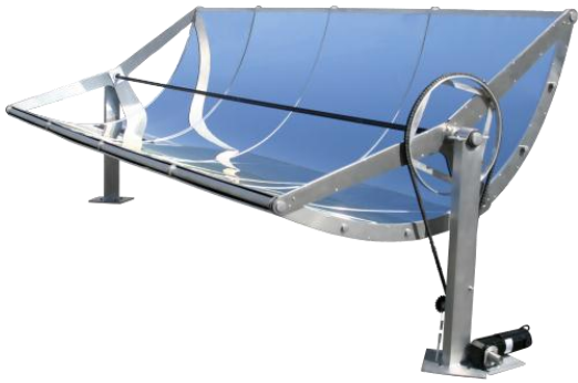
Fig. 2 Solar Collector

The remaining thermal energy will be provided by a natural gas boiler, which will work in series with the solar field and supply thermal energy to the power block when the solar energy is not available.